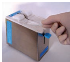
Step 1: Place slides