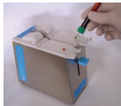
Step 2: Drop blood