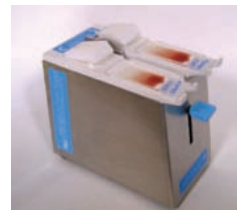
Step 4: Release