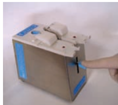
Step 3 : Press down